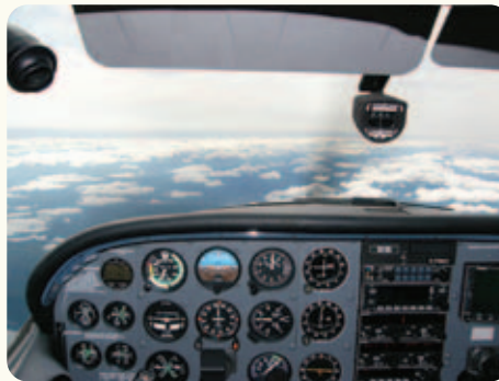
Exmple of an older cockpit instrument panel

On the floor of the cockpit are pedals. These pedals are not to accelerate