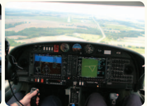
Exmple of a modern cockpit instrument panel

or brake, instead they are used to operate the rudder . When the pilot pushes the right pedal, the rudder moves to the right. It will move left when the left pedal is pushed. On some aircraft the brakes (which are used only on the ground), are located on the top of the floor pedals.