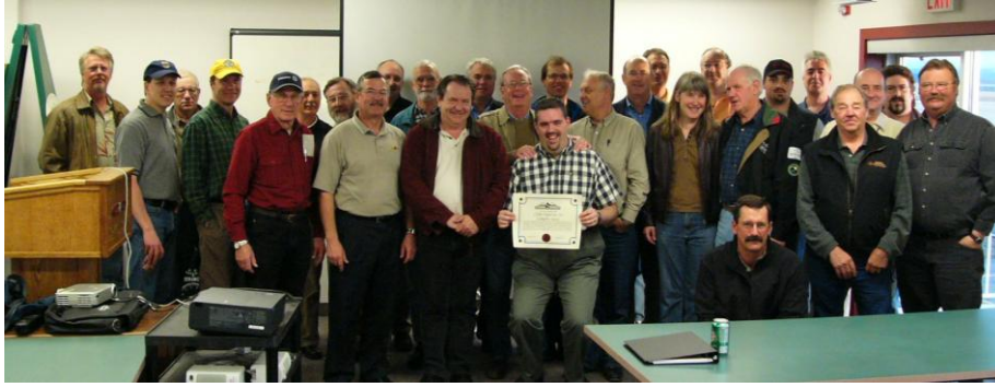
COPA Flight 14 - Calgary